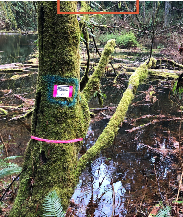
A timber sale boundary sign on a tree within the wetland highlights the narrowness of wetland delineation often seen in sale.