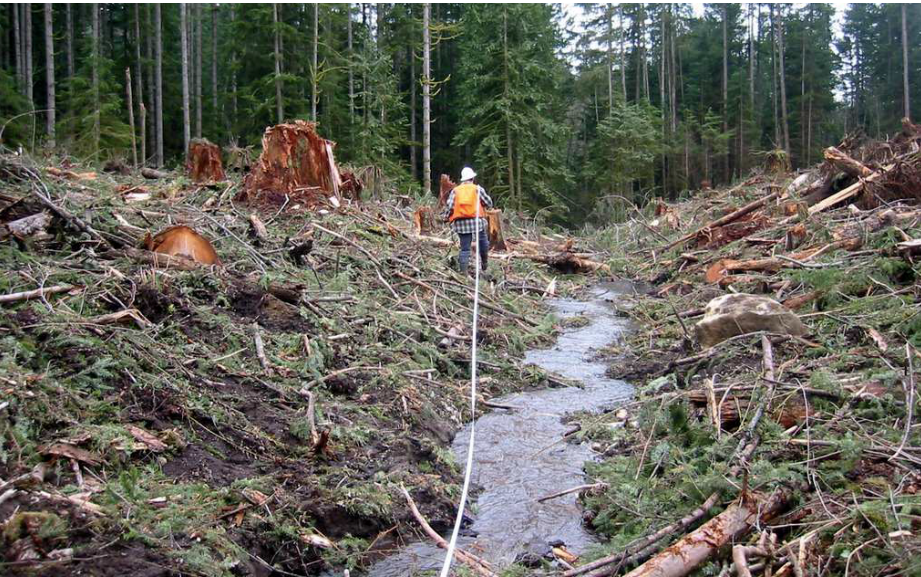
An example of a mistyped stream; this stream was logged as non-fish type (Type N), but, after it was clearcut logged, surveys found fish in the stream.